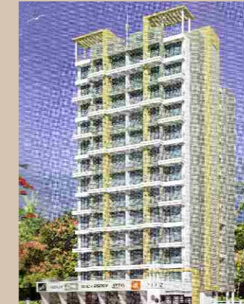
SILICON RESIDENCY ROADPALI, KHARGHAR