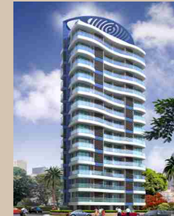
PRATHMESH VIEW NAHUR [W]