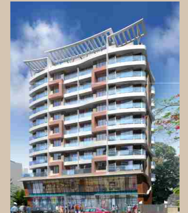
PRATHMESH VAIBHAV VIKHROLI [E]