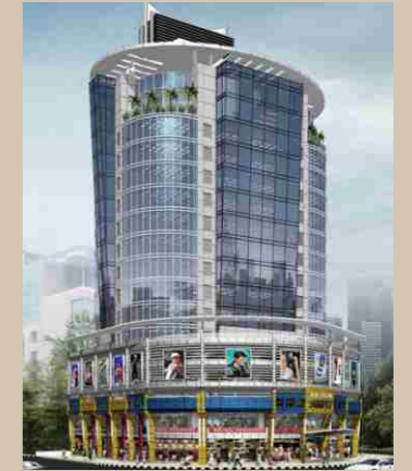
REALTECH PARK VASHI, NAVI MUMBAI