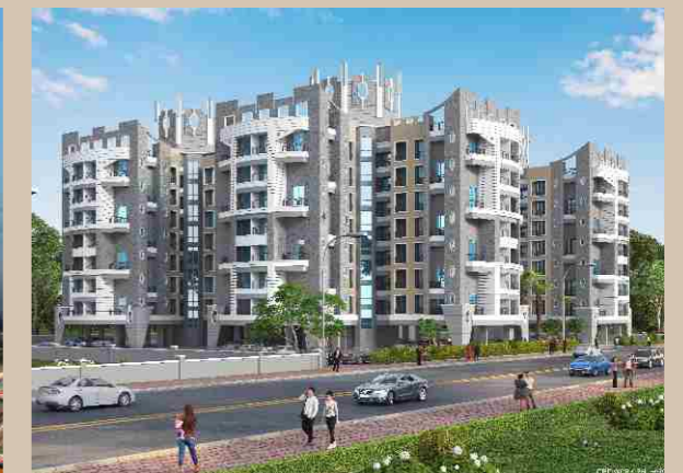
KONARK MEADOWS KALYAN