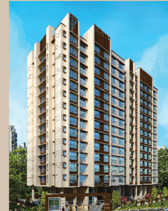
SILICON ENCLAVE TILAK NAGAR